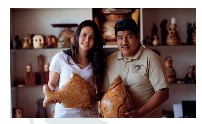
HERVENTURE - MEXICO Partners: Angélica Fuentes Foundation

HerVenture is our new mobile learning tool, designed to deliver bite-sized business training to 1,000 women entrepreneurs in Mexico.